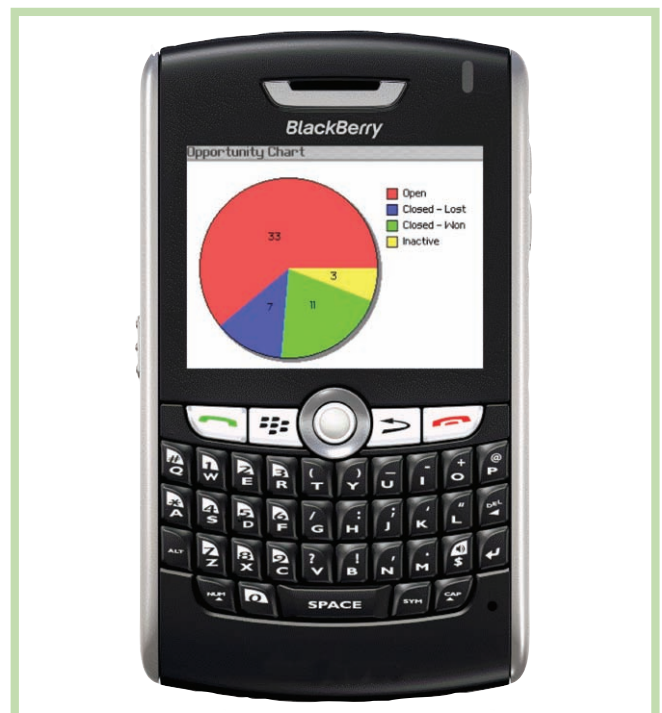
Sage SalesLogix Mobile delivers charting capabilities on the BlackBerry, providing the ability to create and display customised charts.